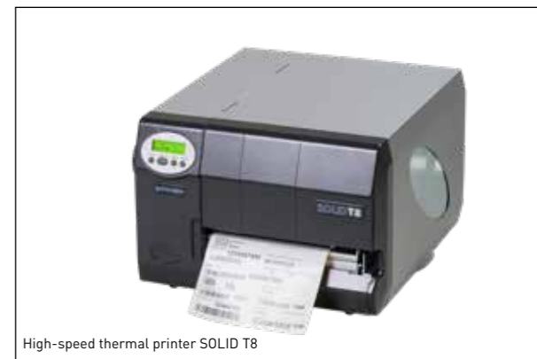
High-speed thermal printer SOLID T8