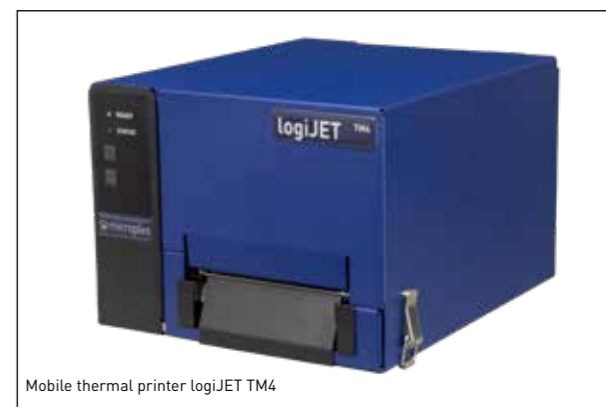
Mobile thermal printer logiJET TM4