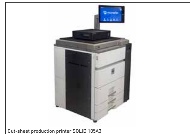
Cut-sheet production printer SOLID 105A3

Examples of Microplex products for replacement in SAP printing environments.