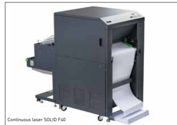
Continuous laser SOLID F40