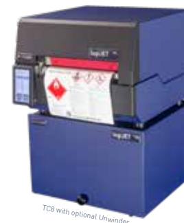
TC8 with optional Unwinder

Customer / Application specific modifications possible.