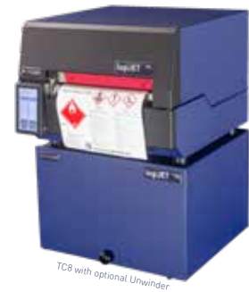
TC8 with optional Unwinder

MICROPLEX PRINTWARE CORPORATION 30300 Solon Industrial Pkwy Suite E, Solon, OH 44139 USA Phone: +1 440-374-2424 E-Mail: info@microplex-usa.com