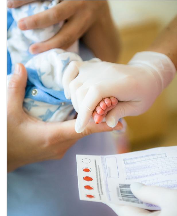
Heel Prick Specimen Cards