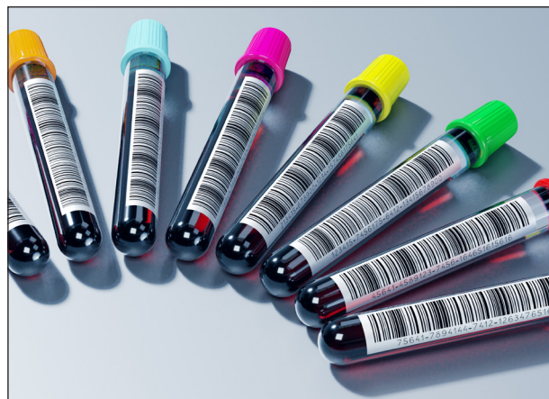
High quality labeling