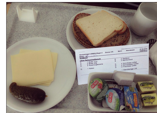
Meal Guide Cards