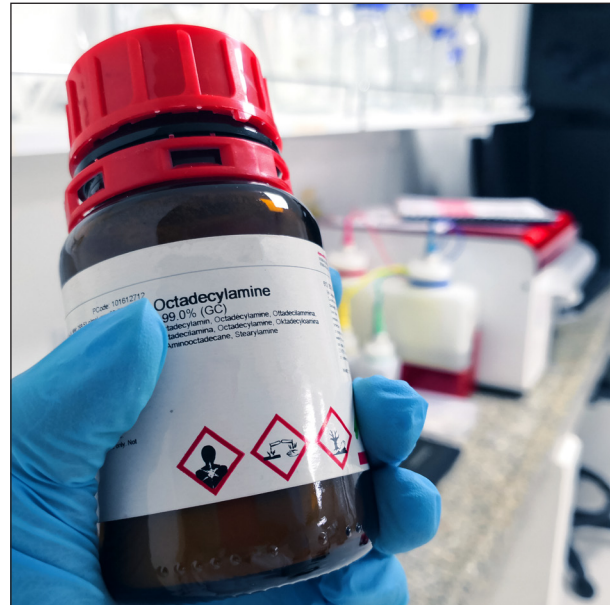
2-color labeling for hazardous warnings